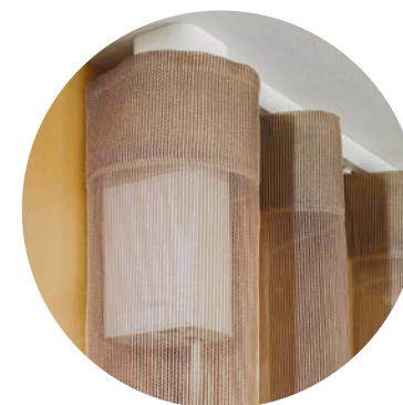
Electric curtain tracks