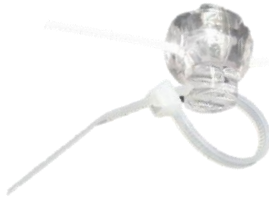
Safety Cord Toggle (including cable tie) Additional packs of 100

For Roman Blinds with rod pockets greater than 20cms at any point a Curtain Rail Supplies Ltd breakaway device must be used on each cord. The device that we supply with our Roman Blinds is the Safety Cord Toggle. The cord should be left unknotted to ensure that the cord can pass through. This must be secured to the blind to ensure that this doesn't fall to the floor and become a choking hazard in the event of a breakaway happening (stitched or using cable tie). These toggles are supplied with every Curtain Rail Supplies Ltd Roman Blind at no extra cost.