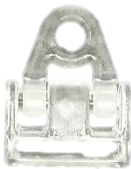
Cord Breakaway Device For Pockets or Eyelets

To prevent cords being pulled up into the headrail, additional devices are available. On a minimum of the bottom two rod pockets, Cord Breakaway Devices can be used. This enables you to tie a knot to the cord underneath the Safety Cord Toggle, the knot also ensures the Toggle cannot fall to the floor.