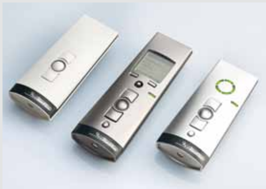
Remote controls Silent Gliss 9940