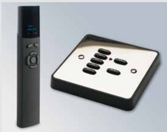
Remote controls Silent Gliss 0450

Our Customer Services team will be on hand from the start to offer expert advice on the most appropriate systems, control combinations and wiring for your project.